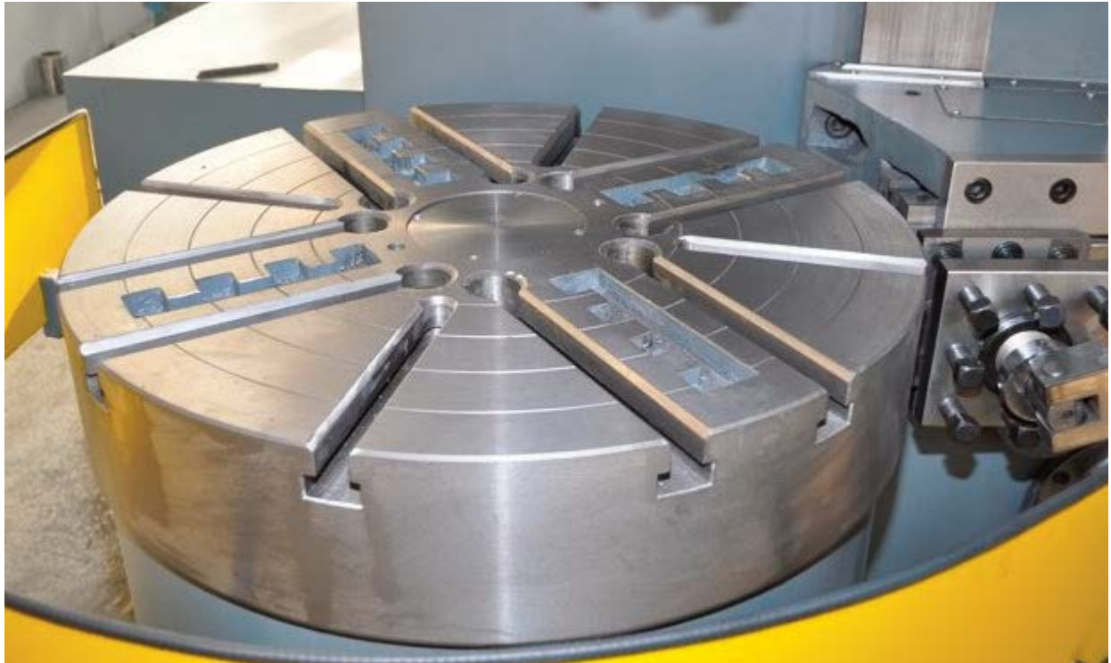
AJVTL 800 Table